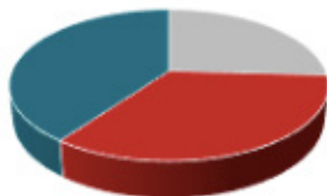
2022 Total Revenues

■ Fundraising ■ Investments/Other ■ Program Service Fees