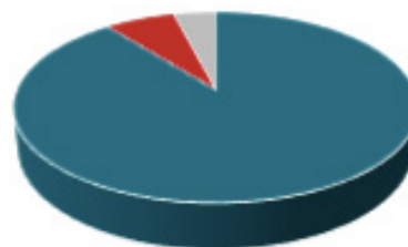
2022 Total Expenses

■ Program Expenses ■ Management/G&A ■ Fundraising